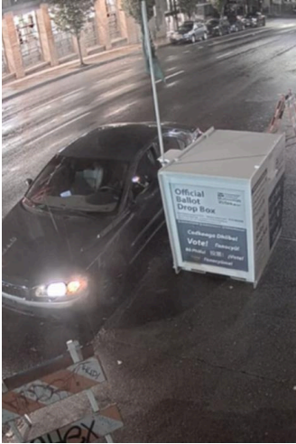
Ballot Box and Suspect Car - Portland, Oregon

Vancouver, Washington Portland, Oregon October 2024