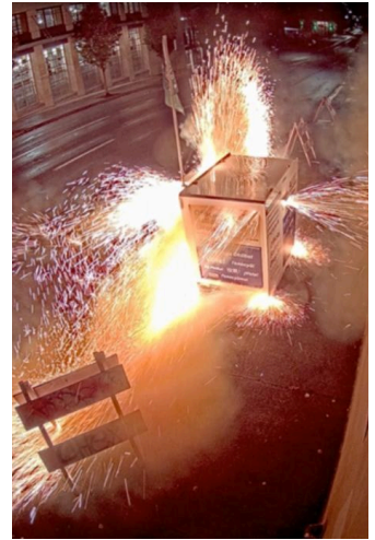
Ballot Box - Portland, Oregon